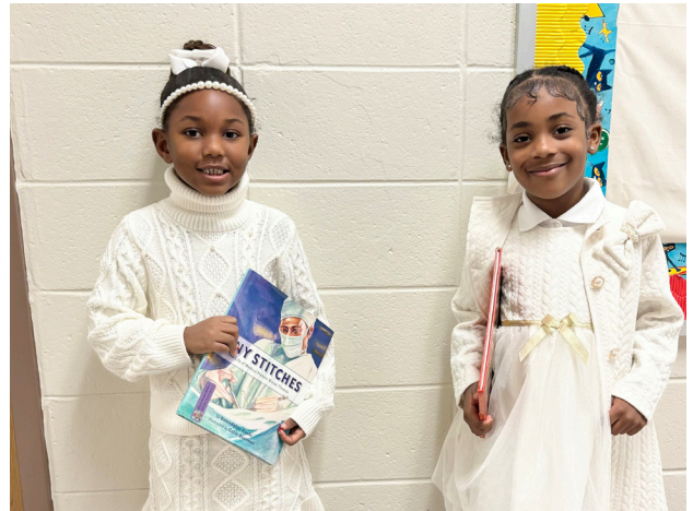
Students dress up like Ruby

Here are just a few examples from previous Ruby Bridges Walk to School Day events. Communities across the country celebrated with StoryWalks®, book giveaways, themed dress-ups, and, of course, walking to school together. Many schools hosted art and essay contests, classroom discussions about diversity and inclusion, and student performances or skits inspired by Ruby Bridges' story. Some organized kindness challenges, collaborative murals, and musical activities, while others invited guest speakers or local leaders to join the celebration. Each event highlighted courage, community, and the joy of coming together to make a positive impact.