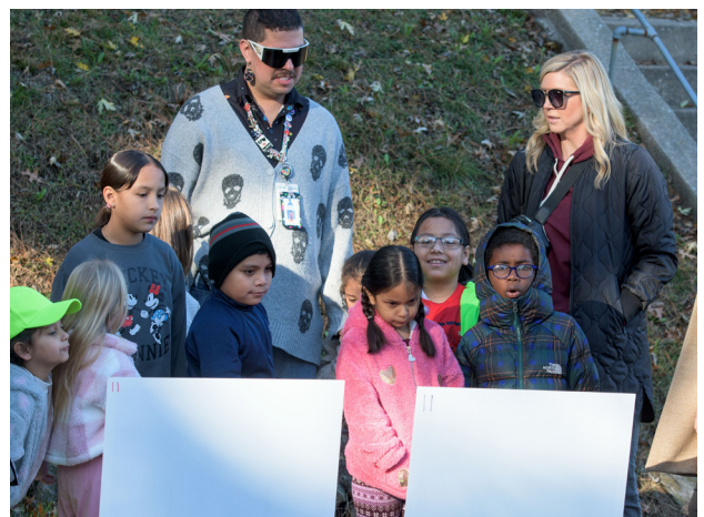
StoryWalks® tell the Ruby Bridges Story