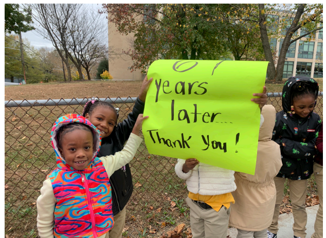
Children walk to school